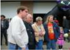
Costume Contest Judges